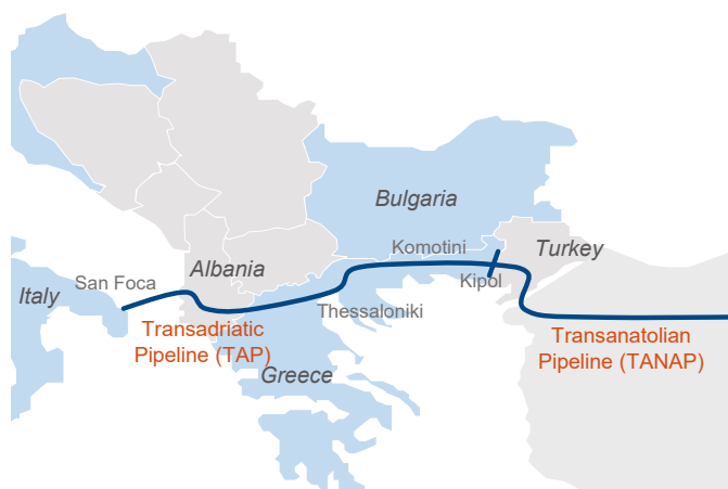
Figure 4: TAP/TANAP pipeline