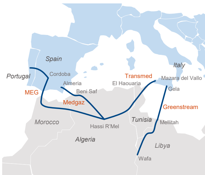
Figure 2: Transmed, MEG, Medgaz and Greenstream pipelines

Transmed was the first subsea pipeline to be built across the Mediterranean. It had been in discussion since the 1960s, but the technology to build it could not be developed until the late 1970's/early 1980's. State-owned Italian gas buyer ENI was responsible for pushing the project to fruition, assuming responsibility for both technology development and financing. The project was not made easier by the strained relationship between transit country Tunisia and supplier Algeria. It is notable that because of this, there is no tripartite agreement between the three parties involved – ENI negotiated separate HGA agreements with Tunisia and Algeria.